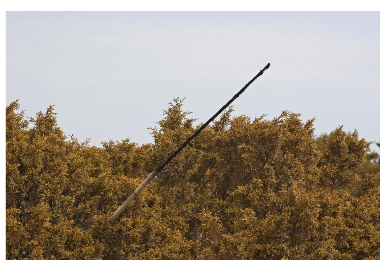
9000 to 10 000 lethal gunshots and lime sticks for Bee-eaters in the migration bottle neck of the South Eastern Peninsula with Cape Greco in September 2008.