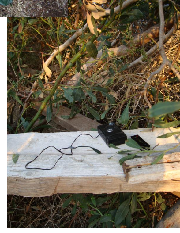
Mini tape lure equipment with device of tape and loudspeaker and a battery for a few hours