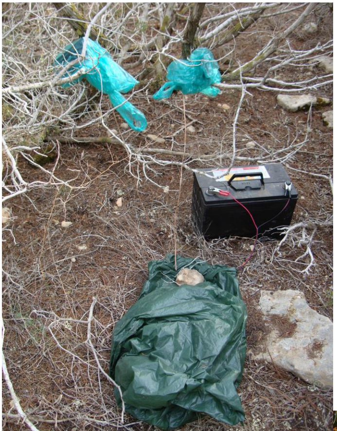
Tape lure with loudspeakers, device with a tape and a battery