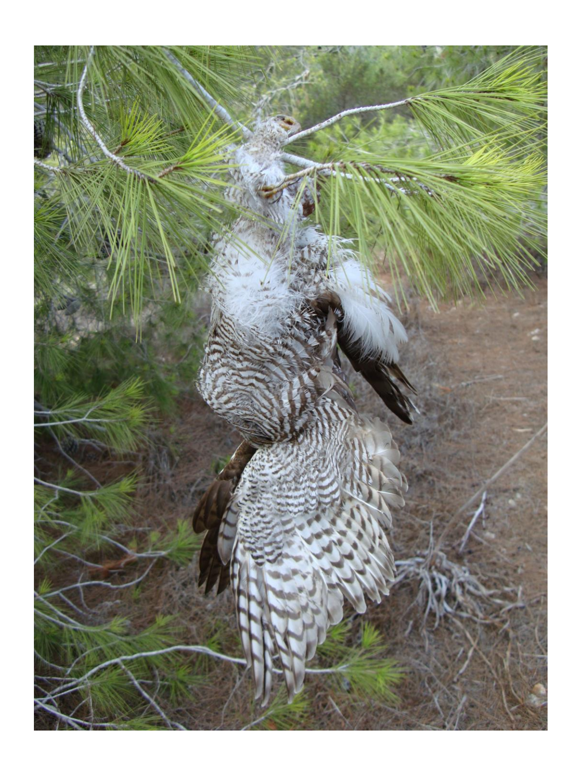
Goshawk tortured to death