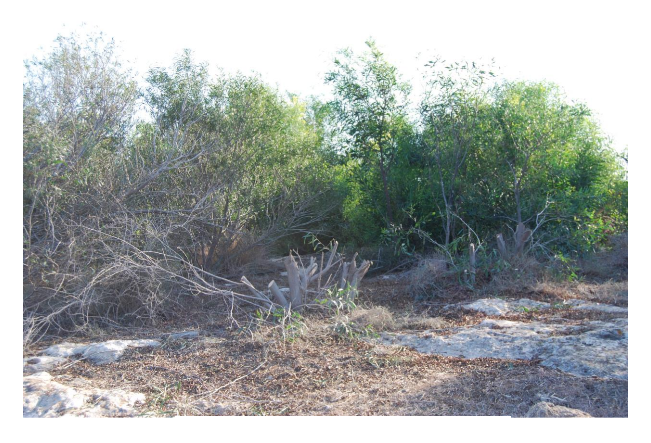
Irrigated sites get prepared for bird trapping