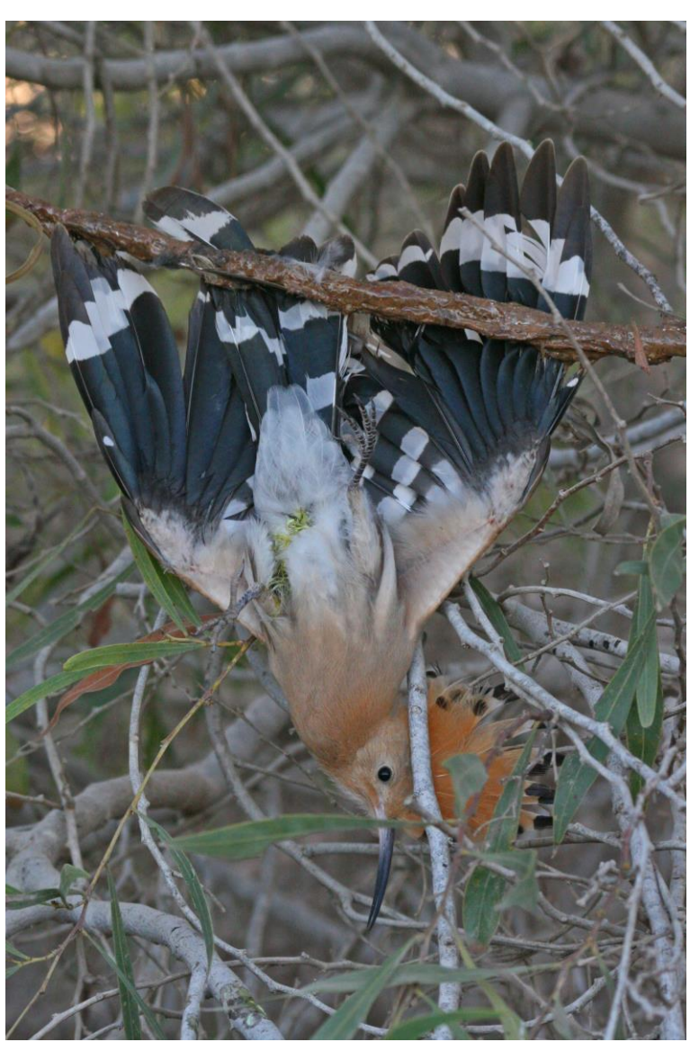
Hoopoe on lime stick