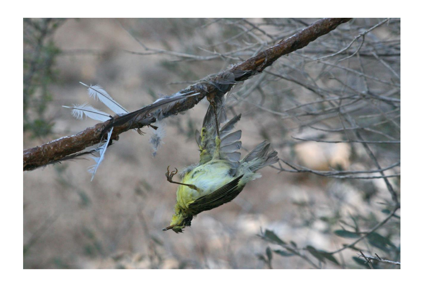
Lime sticks the most cruel killers