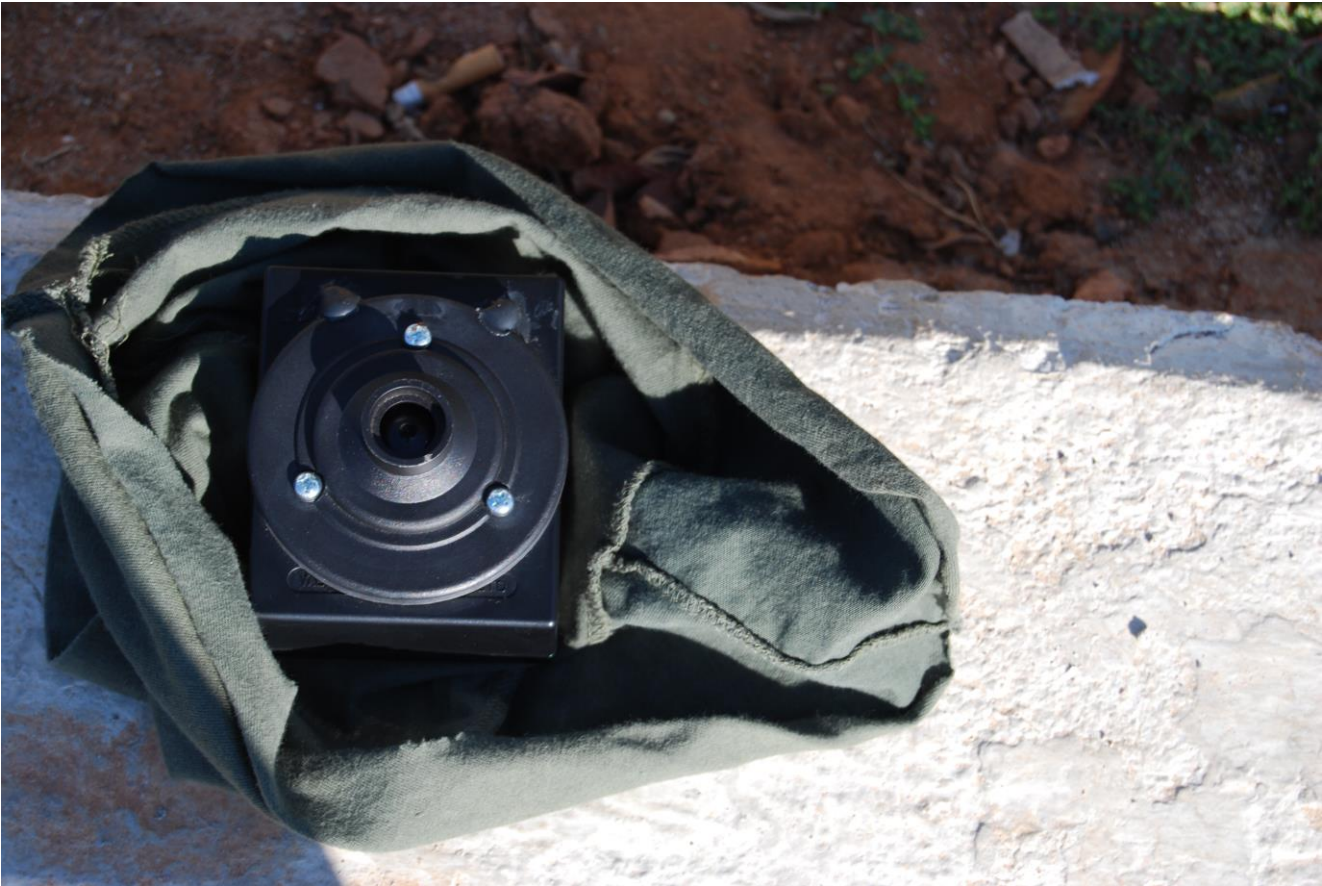
New: Chinese small amplified lure all in one device: loudspeaker, battery and cassette