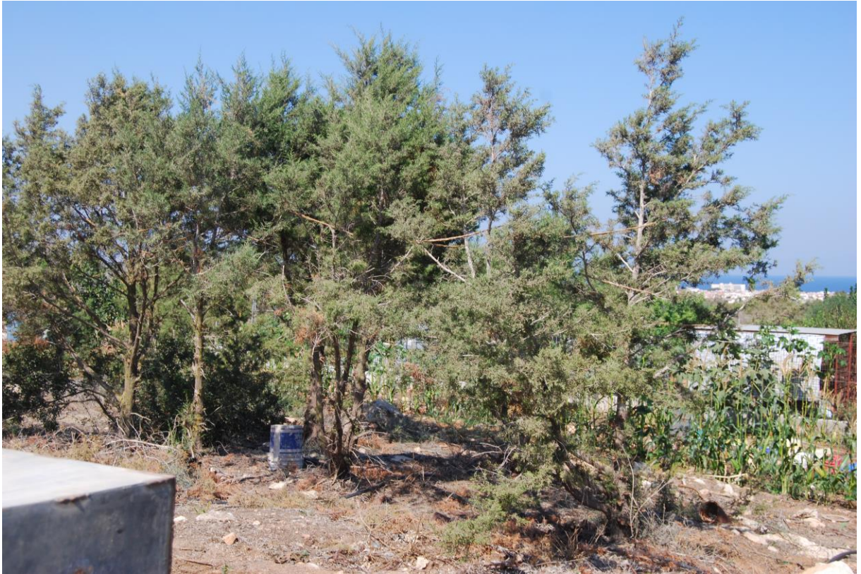
Lime sticks in fields and gardens