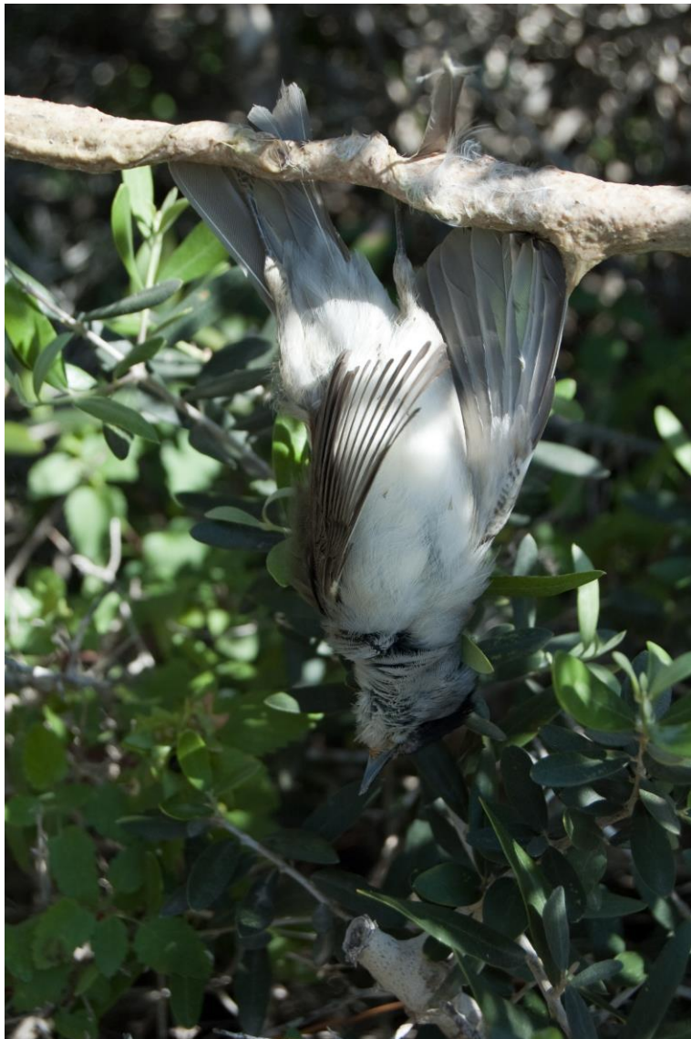
Birds on lime stick