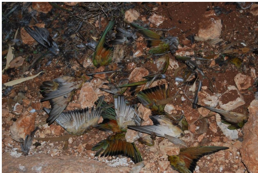
Masses of killed bee-eaters