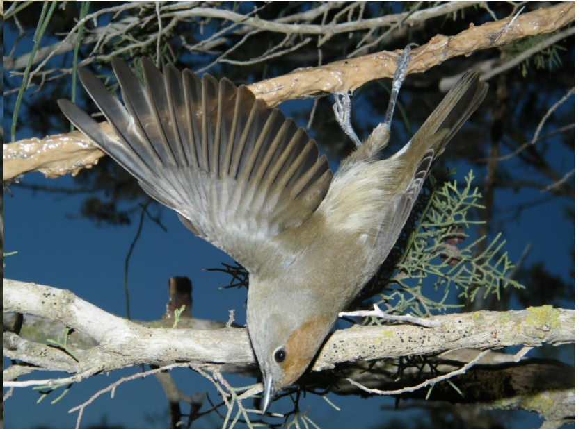
Cruel and inhumane practices