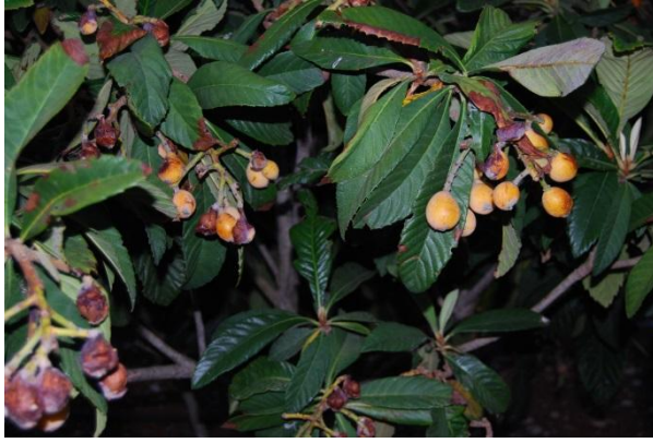
Loquat (engl). Mespina (Greek)